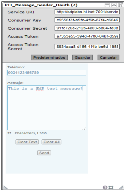
Figure 1 EzWeb PII Message Sender gadget

In a similar manner, other use cases could be presented making use of other SDP capabilities like Presence and Contacts.